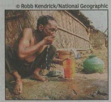
LIFE ON THE LINE